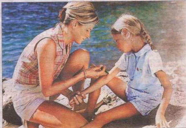
Mosquito-Click: Taking the sting out the mozzies.

CAMPING season has arrived and that means the mossies have fired up, especially along the riverbanks. This innovation doesn't keep those buzzing