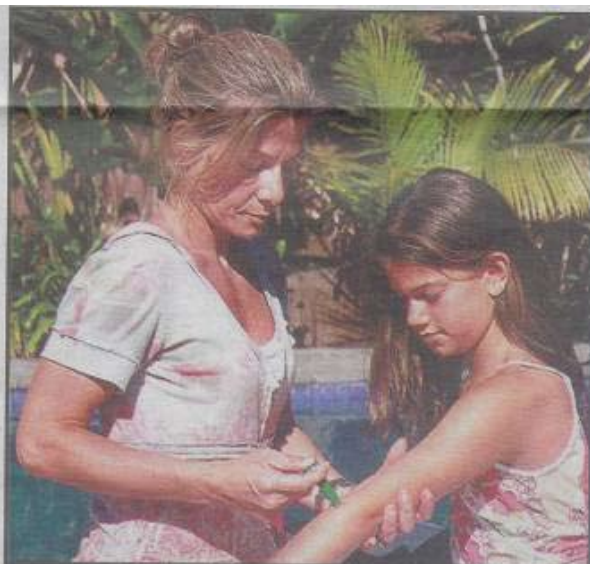
MOSQUITO-Click is a chemical-free way to stop the itchiness and inflammation of mosquito, sandfly and bull ant.

The Mosquito-Click is available from Kmart , My Chemist , Bay's Outdoor